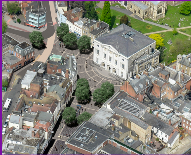
Aerial view of proposed works